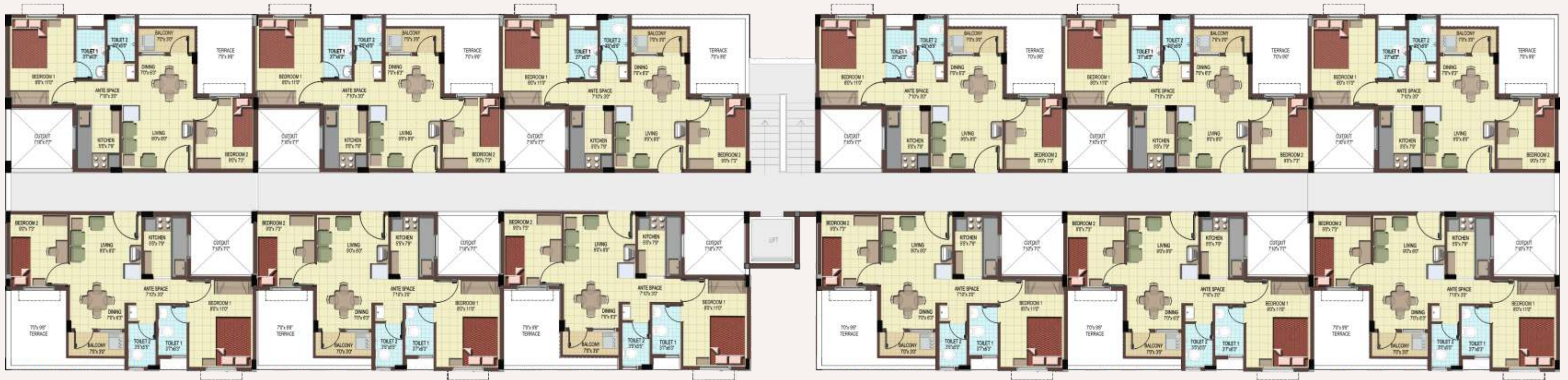
TYPE 3 Typical Floor & Unit Plan: 2 BHK / 594 sq.ft.