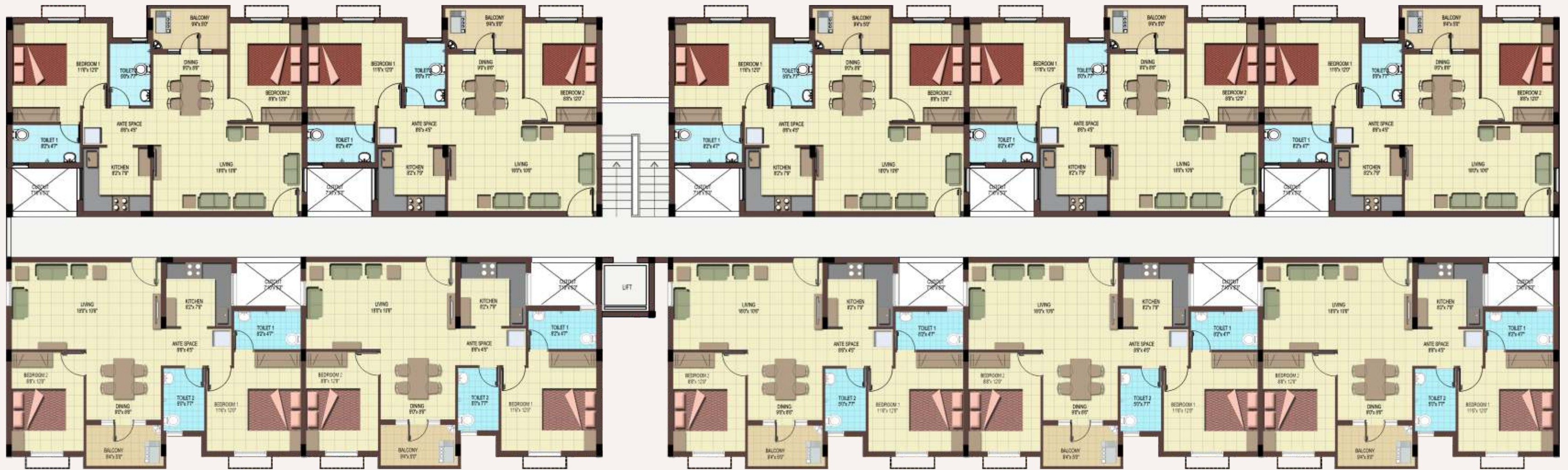
TYPE 1 Typical Floor & Unit Plan: 2 BHK / 963 sq.ft.