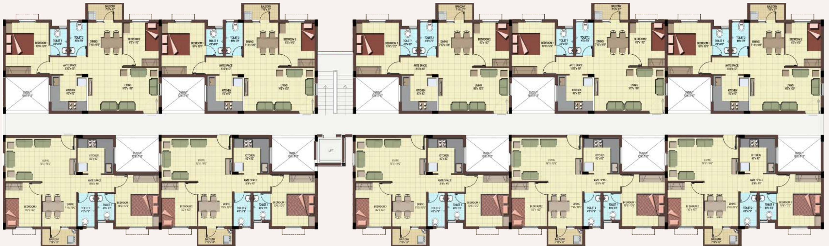
TYPE 2 Typical Floor & Unit Plan: 2 BHK / 886 sq.ft.